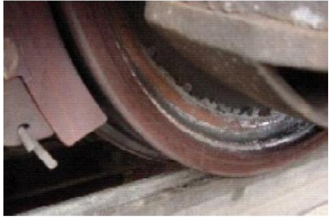
Overheating affecting the wheel rim/web transition [EN 15313, §C.3.2.2]

If the problem is not detected immediately the rim/web transition can gradually assume a rusty appearance with shades between greyish-brown and brown covering the whole circumference. [EN 15313, §C.3.2.2]