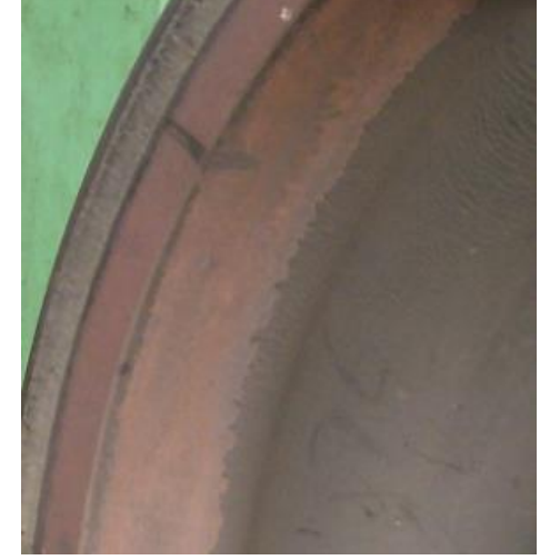
Old and fresh burnt paint