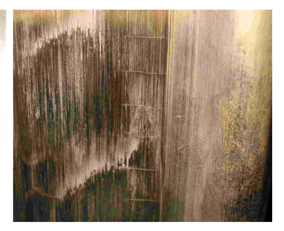
Example for single cracks on the wheel tread by visual inspection