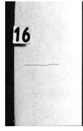
Transverse crack revealed by magnetic particle testing [EN 15313, §C.2.6]

Description: The tread exhibits cracks at an angle of approximately 90° to the circumference of the wheel and have a typical length of 30mm or more. Transverse cracks generally develop at the surface in either straight or slightly crooked lines and can penetrate radially (usually of thermal origin in these cases) or branch out in a circumferential direction (usually of mechanical origin in this case). They occur individually and can be distributed at several points around the circumference. [EN 15313, §C.2.6]